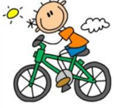
ride a bike