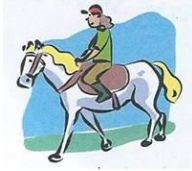
ride a horse