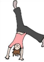
do a cartwheel