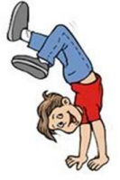
do a handstand