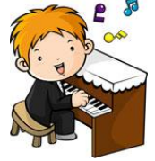
play the piano