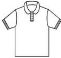
A POLO SHIRT