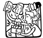
act in a film