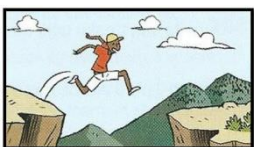
jump from one rock to the next