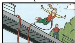
try bungee jumping