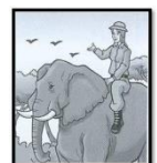
ride an elephant