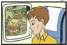
travel by plane

Homework → Rédige des phrases au "present perfect" sur les choses extraordinaires que tu as vécues jusqu'à présent.