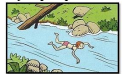
swim in a river