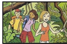
walk in a rainforest