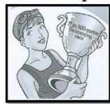
win a swimming competition